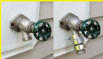
HOSE BIB VACUUM BREAKER BREAKER

A cross connection is an actual or potential interconnection between a drinking water line and any source of pollution or contamination such as a piping arrangement that allows drinking water to come in contact with non drinking water, chemicals, gases or other potentially harmful substances. Plumbing cross connections exist whenever a pipe carrying drinking water has a direct physical connection to a source of potentially harmful materials.