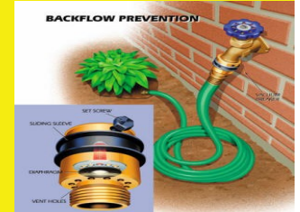
HOSE BIB VACUUM

These are just a few examples that could occur if there was a pressure drop in the distribution system due to a water break, causing the back siphonage of these hazardous materials into the water system