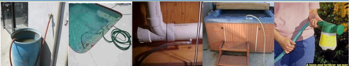
A hose-end fertilizer sprayer