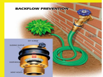
HOSE BIB VACUUM

These are just a few examples that could occur if there was a pressure drop in the distribution system due to a water break, causing the back siphonage of these hazardous materials into the water system